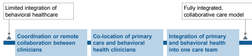
EXHIBIT 1. CONTINUUM OF APPROACHES TO BEHAVIORAL HEALTH INTEGRATION

The models of behavioral health integration fall into three categories along this continuum: